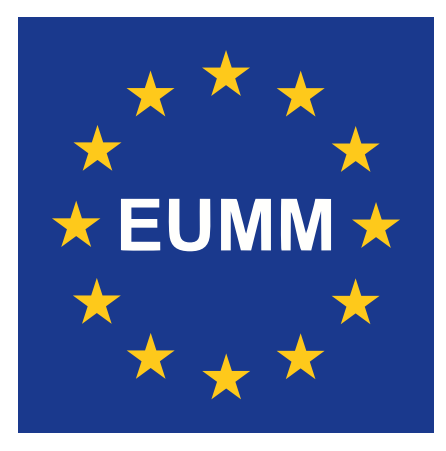
European Union Monitoring Mission in Georgia